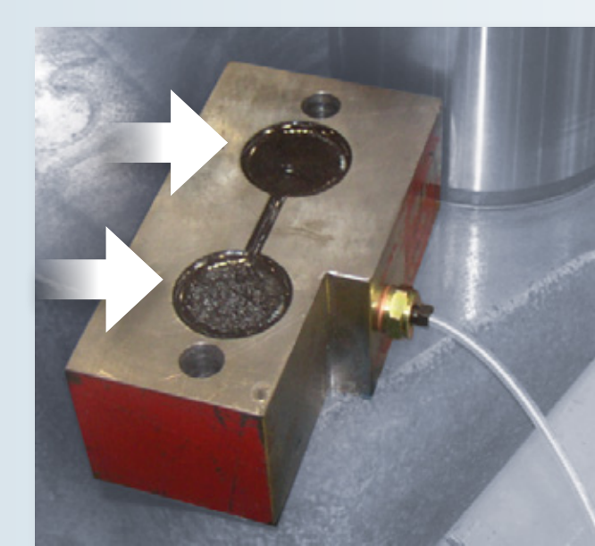
Force sensors in stop block