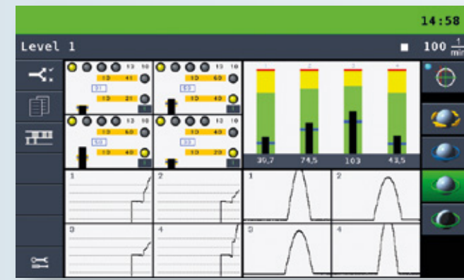
Cockpit mask for display the adjustment and stop block forces